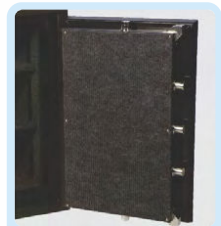
3 Way Locking