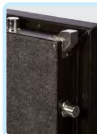
Unique Corner Bolts

Allow 50mm projection for door furniture on depth of measurement