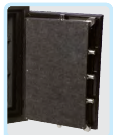
3 Way Locking